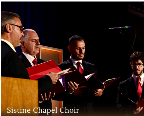
Sistine Chapel Choir

Transfer on own to the airport for independently scheduled flights back to the USA.