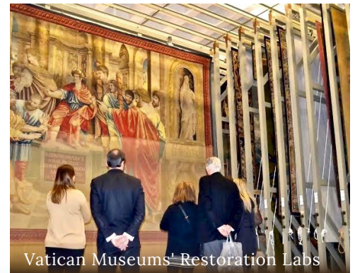
Vatican Museums' Restoration Labs